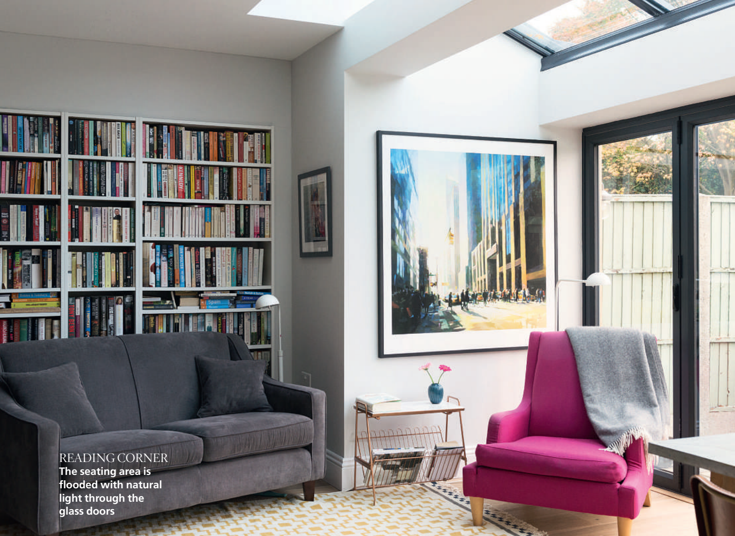
READING CORNER The seating area is flooded with natural light through the glass doors