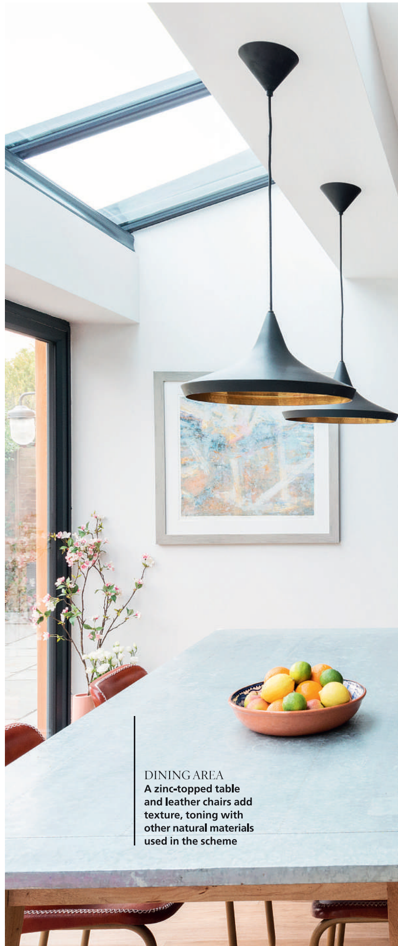
DINING AREA A zinc-topped table and leather chairs add texture, toning with other natural materials used in the scheme